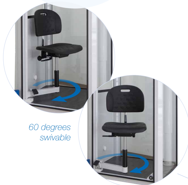
60 degrees swivable

The swivable patient chair and the extremely low door step allow even physically impaired patients easy cabin entry.